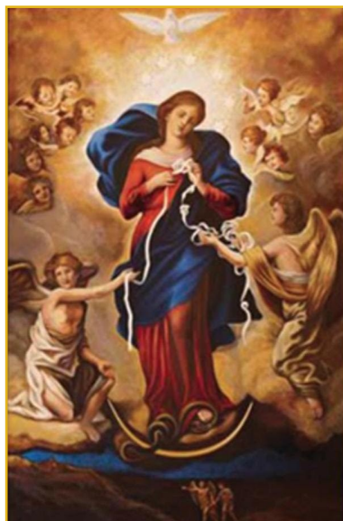
Mary, Untier of Knots, Pray for Us