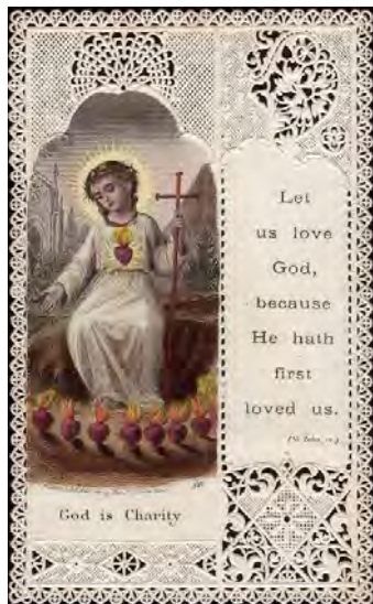
The Sacred Heart, Guide Me