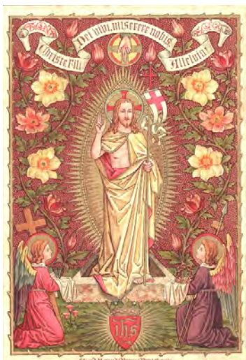
Jesus Christ is Resurrected